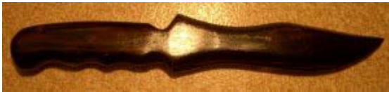
Narra Wooden Training Dagger/Knife 28 cm Narra (AKA Ebony wood) training knife/ dagger with blunt rounded edge.