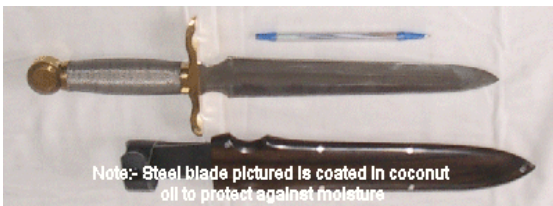
Magdellan Dagger with Sheath Hand made in the Philippines with stainless steel string handle and stainless steel 9" inch blade, brass end and hilt and Kamagong wood sheath.

Note: Steel blade pictured is coated in coconut oil to protect against moisture